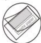
when the laminating film doesn't fit:figure A